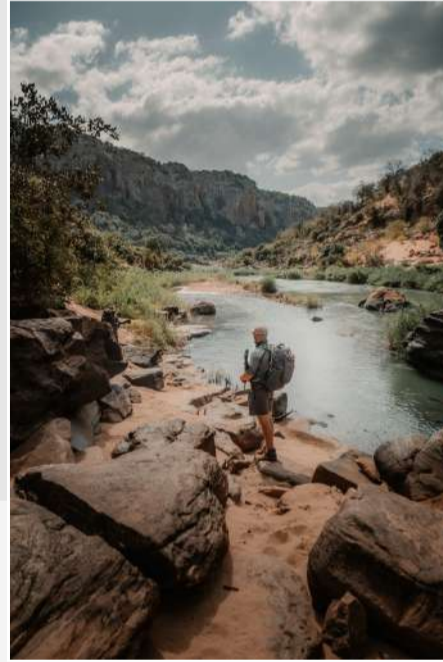
Water is provided by the pristine Levuvhu River.